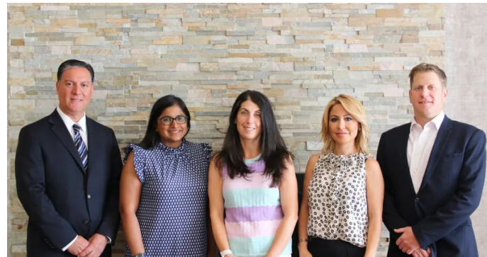
(Pictured Left to right)